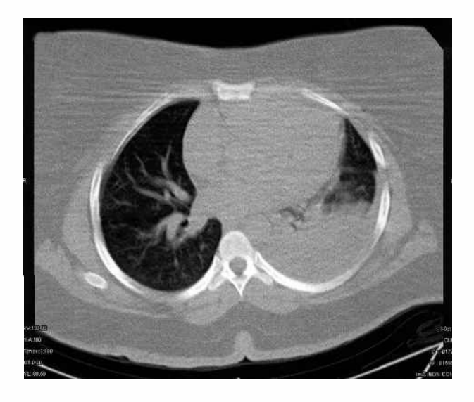
Figure 3. Chest CT showing large left pleural effusion.

nostic thoracentesis was performed, revealing sanguinous fluid with elevated white cells, LDH and total protein, but no organisms. The patient was discharged home on the 9th postoperative day, asymptomatic and oxygen-independent, with plans for an outpatient therapeutic thoracentesis.