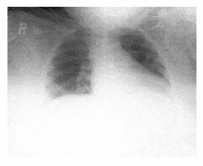
Figure 2. Postoperative chest x-ray showing resolution of the pneumothorax.

oratory tests. She was admitted to the intensive care unit and a pulmonary consultation was obtained. Upon reviewing all available data, the pulmonologists attributed the initial PTX and the gradual development of the pleural effusion, to a significant perioperative pulmonary event (possible embolus) and a subsequent parenchymal infarct. Systemic anticoagulation, therefore, was continued. A diag-